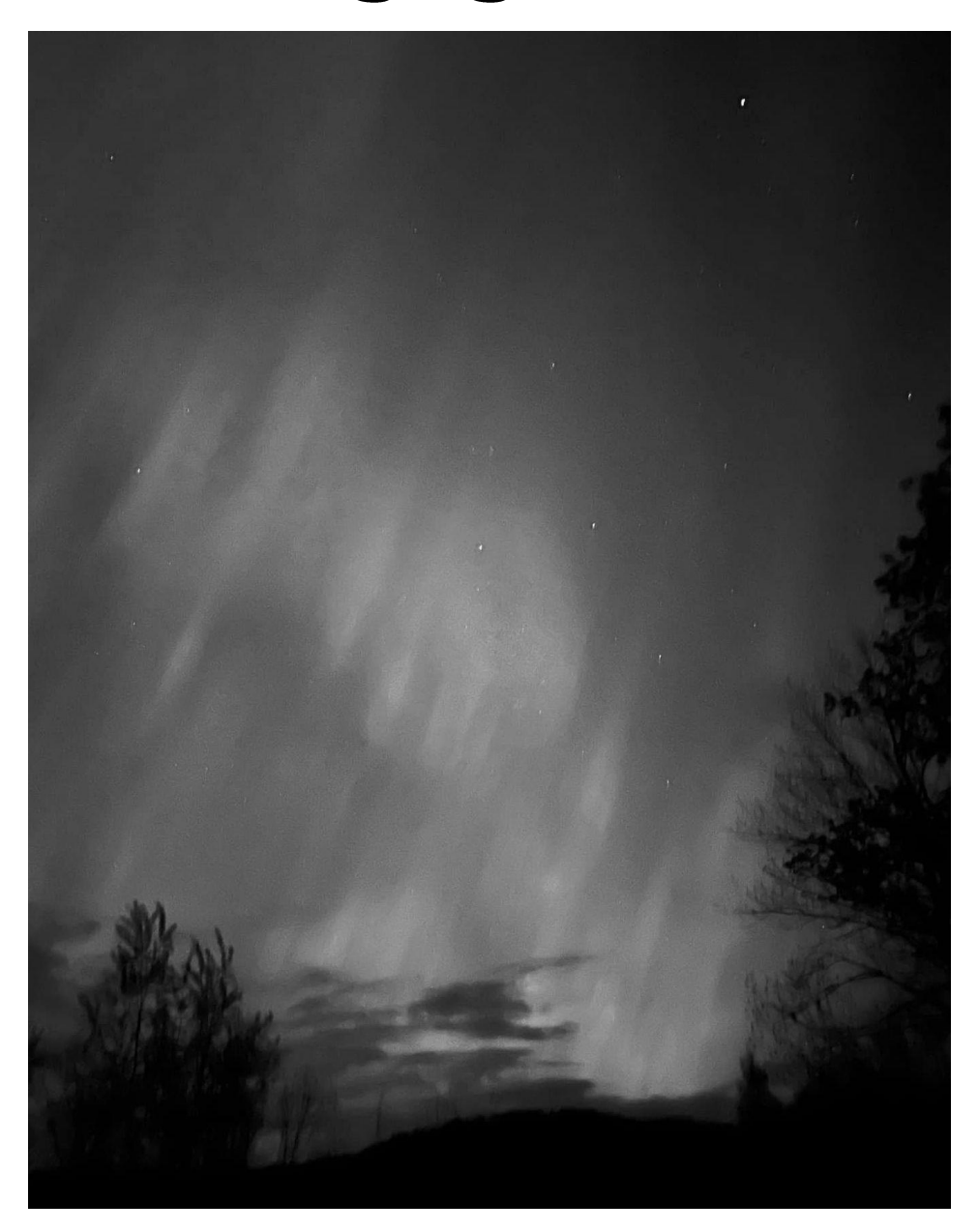
November 1 - 3, 2024 Wisdom From Within and Without